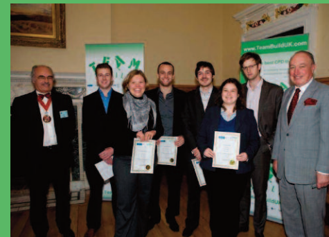
Procurement Strategy: Urban Garden