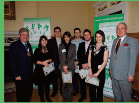
Overall Winners 2008: Building Blocks

It aims to promote understanding and co-operation between young professionals in the construction industry and counts as 4 days CPD as well as helping competitors fulfil several of the core objectives required for chartered membership of many institutions.