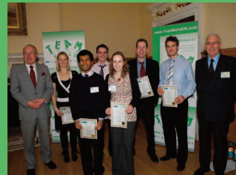
Runners Up: Team Goal